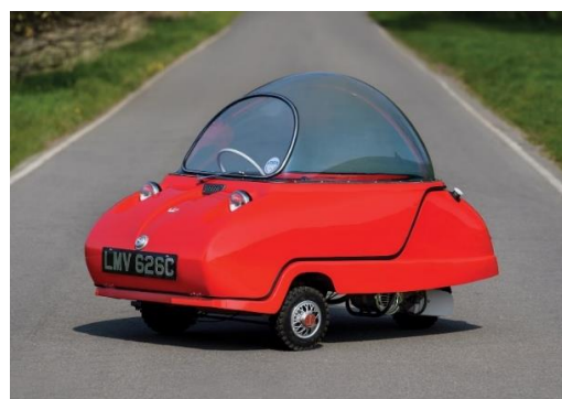
The highly desirable Peel Bubble Car