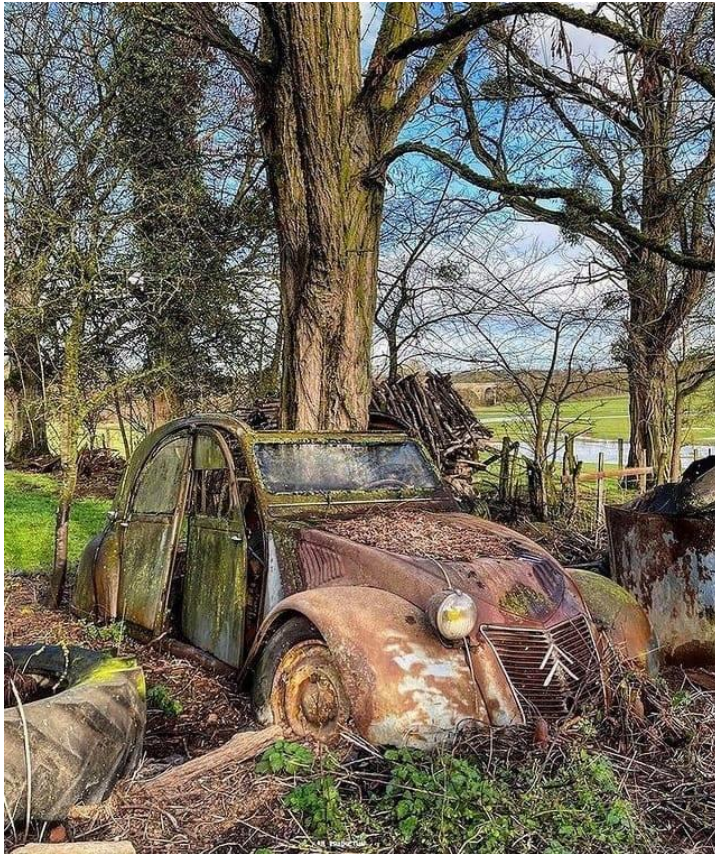
When you want a project and the better half wants a garden...