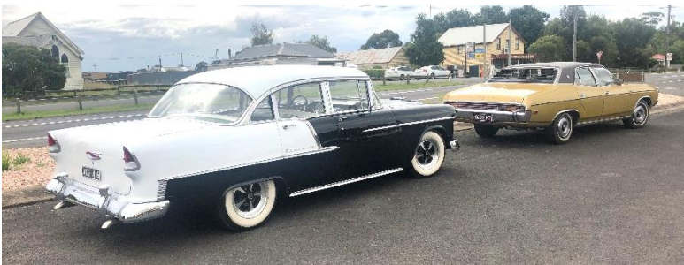
Seen at the Panmure Hotel