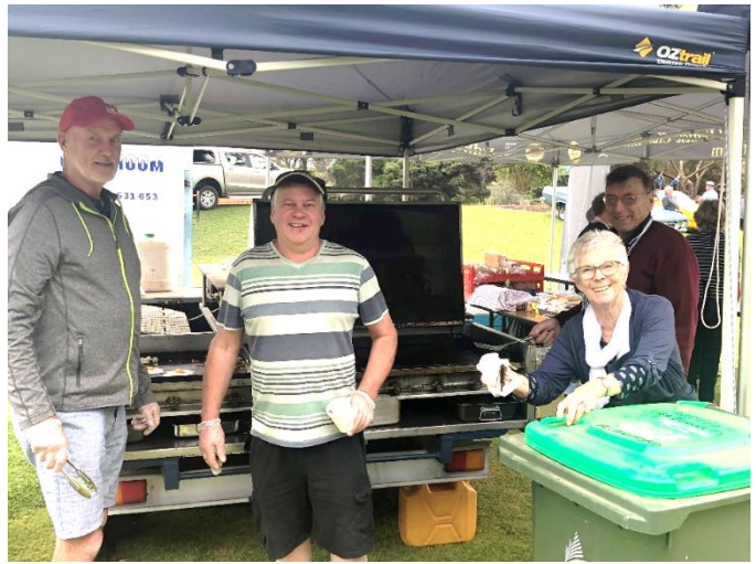
The Egg & Bacon Gang