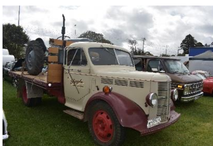
Kelvin Boyle's early model 50's Bedford