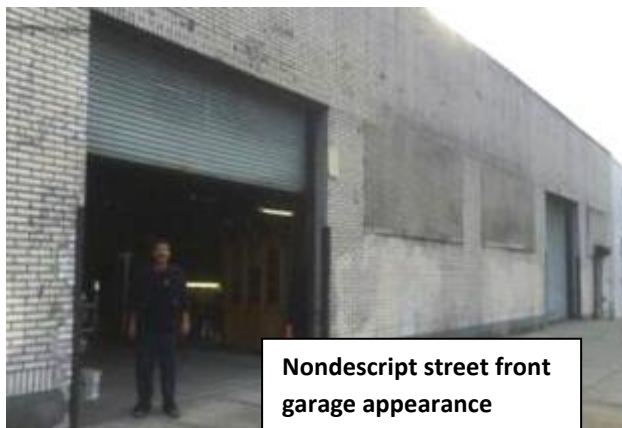
Nondescript street front garage appearance