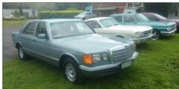
The Port Fairy push lead by Daryl Jago's latest toy.