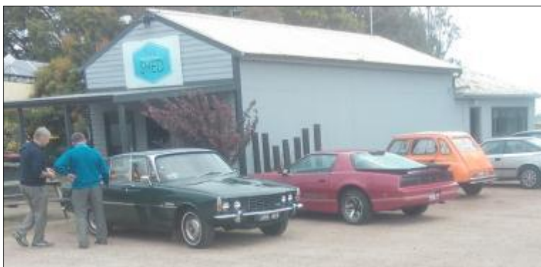
Discussing the finer points of English Prestige Motoring.

This may well be the destination of a future Sunday run with the new club co-captains sounding out the owners.