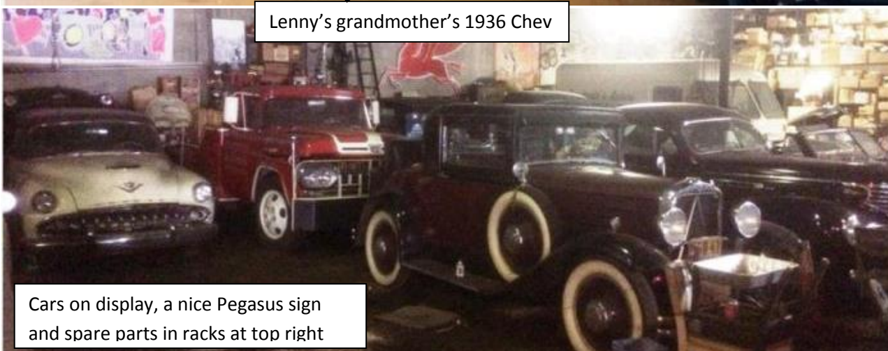
Cars on display, a nice Pegasus sign and spare parts in racks at top right

Lenny's joke: What's the difference between a hippo and a Zippo? A hippo is very heavy but a Zippo is a little lighter. Ian Rees