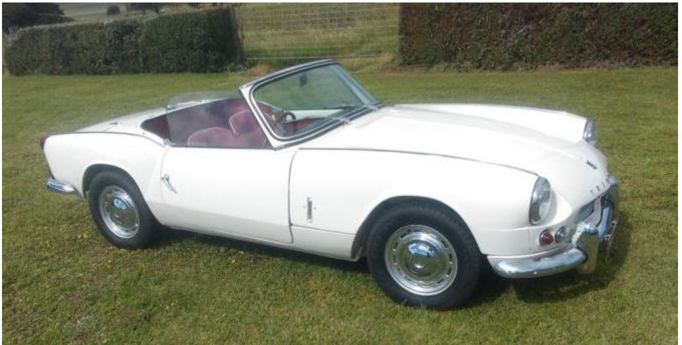
This month's feature vehicle: 1962 Triumph Spitfire Owned by Frances Beks

The vehicle depicted on the Club emblem is the Ziegler steam powered horseless carriage built at Allansford, near Warrnambool, around 1900.