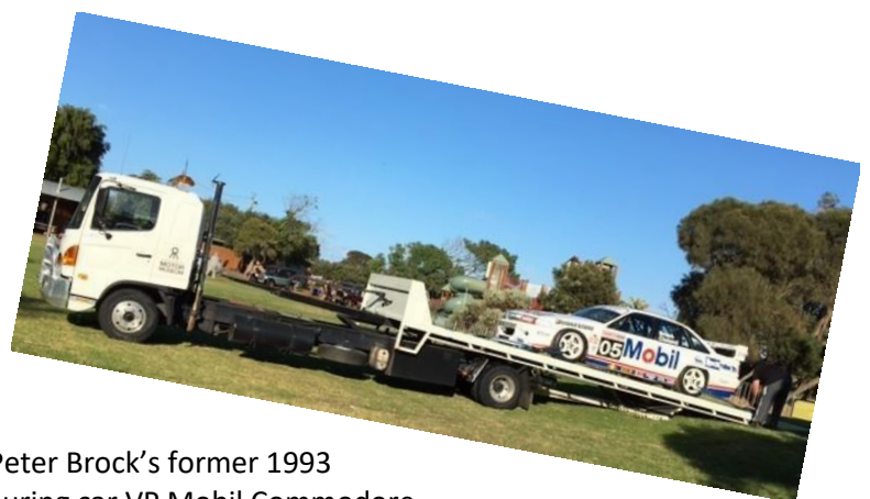
Peter Brock's former 1993 touring car VP Mobil Commodore.