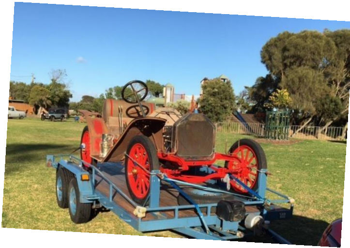
Murray Murfett's 1911 Buick Model 32 Roadster

Thanks to everyone who helped on the day. The day started early with setting up the BBQ, fences and parking vehicles, keeping everyone busy until pack up time. Thanks to those who stayed on to help with this.